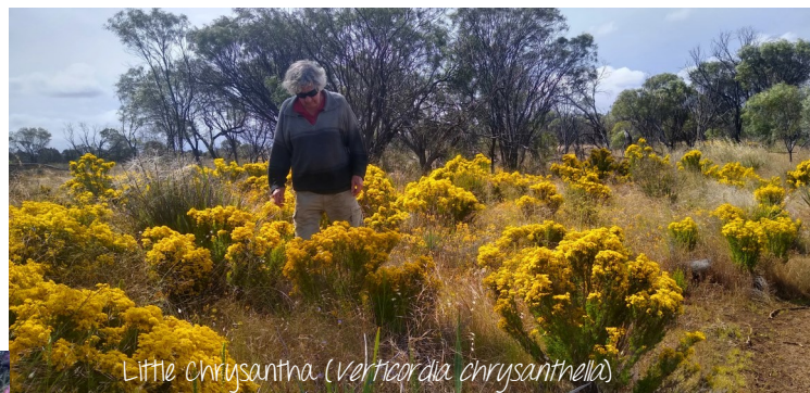
Little chrysantha ( Verticordia chrysanthella )