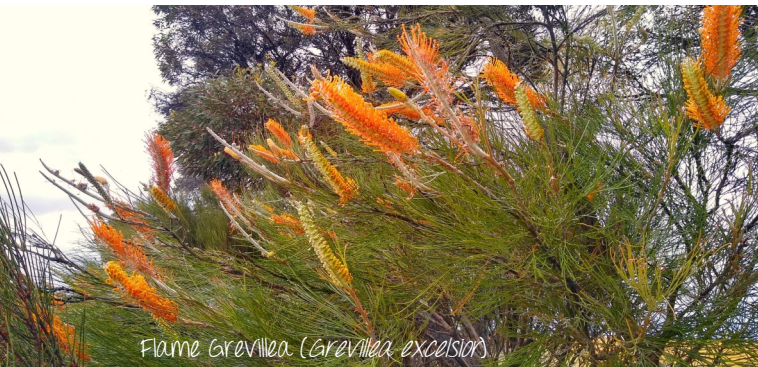
Flame Grevillea ( Grevillea excelsior )