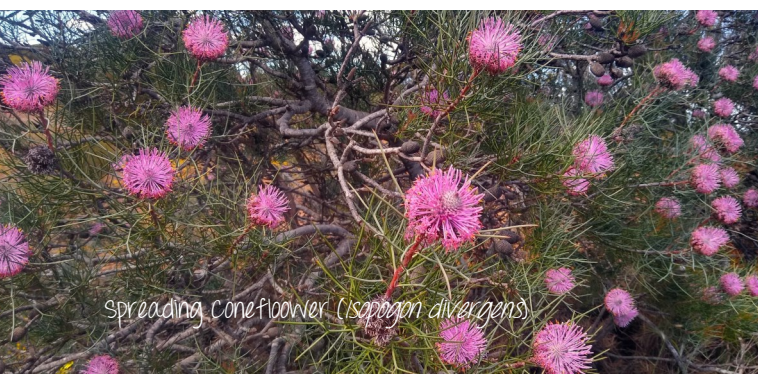
Spreading Coneflower ( Isopogon divergens )