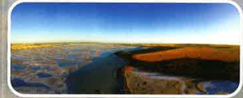
Lake Brown