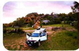
Camping at Eaglestone Rock

Campfire photo above by Kylie Gee www.indigostormphotography.com