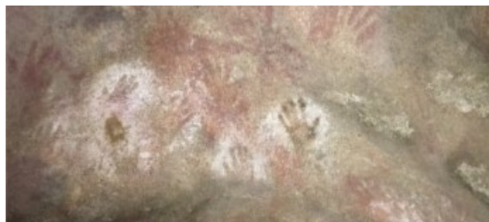
Mulka's Cave - located at The Humps, a giant granite 16km north of Wave Rock the cave holds one of the most significant Aboriginal rock art sites in Western Australia.

Visit the Hyden CRC where you will see some sculptures at the entrance and inside a collection of the Kondinin Art Show Acquisition prizes on canvas.