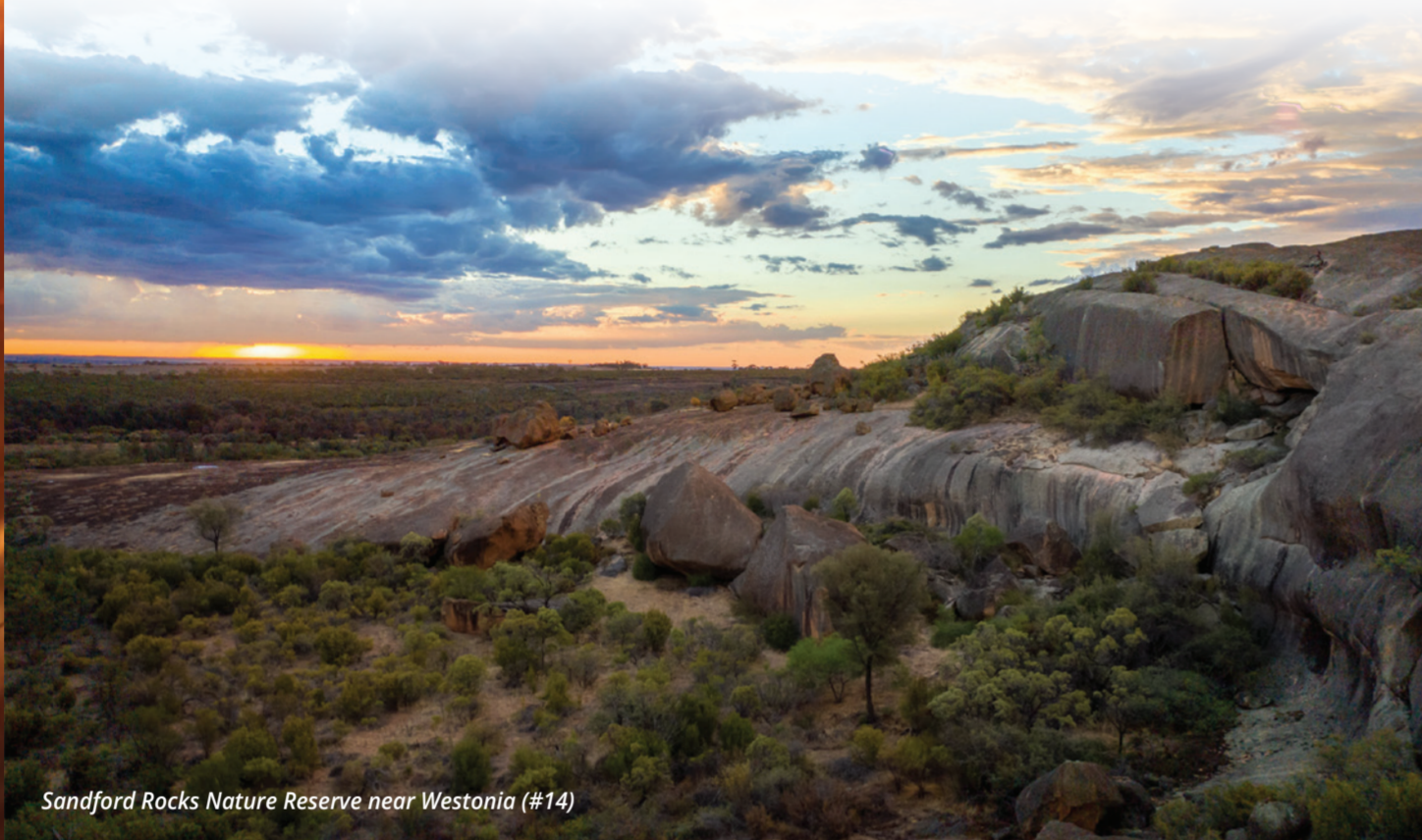
Sandford Rocks Nature Reserve near Westonia (#14)

Accommodation: Bed & breakfasts, self-contained units, farm stays, motels, hotels, caravan parks, RV-friendly towns and free camp sites.