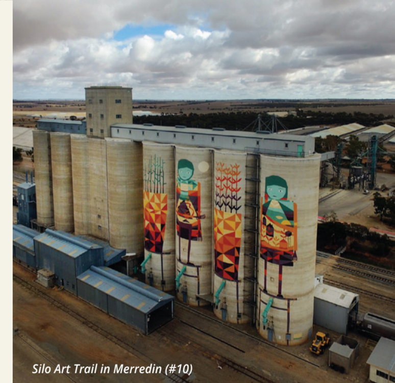
Silo Art Trail in Merredin (#10)

Adjacent to Merredin Peak is a short self-drive trail to the remains of the World War II Army Hospital site, one of many historic military installations dotted throughout the region as reminders of Merredin's role as the second line of defence.