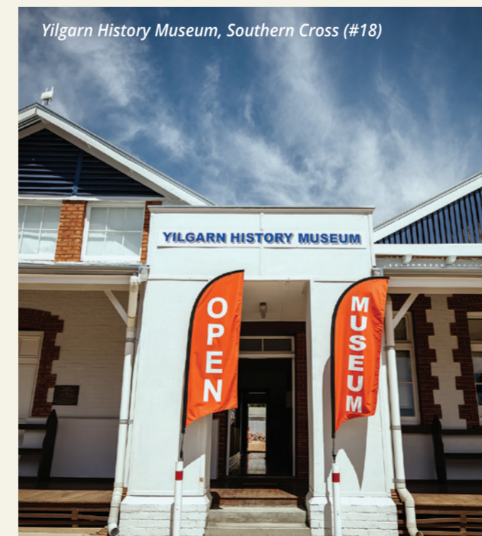
Yilgarn History Museum, Southern Cross (#18)

Or if time permits, travel east to Karalee Dam (see #17 at map ref M4), approximately 55km east of Southern Cross to see the natural reservoir that was adapted to maximise the catchment, delivery and storage of rainwater essential to railway development in the Goldfields region.