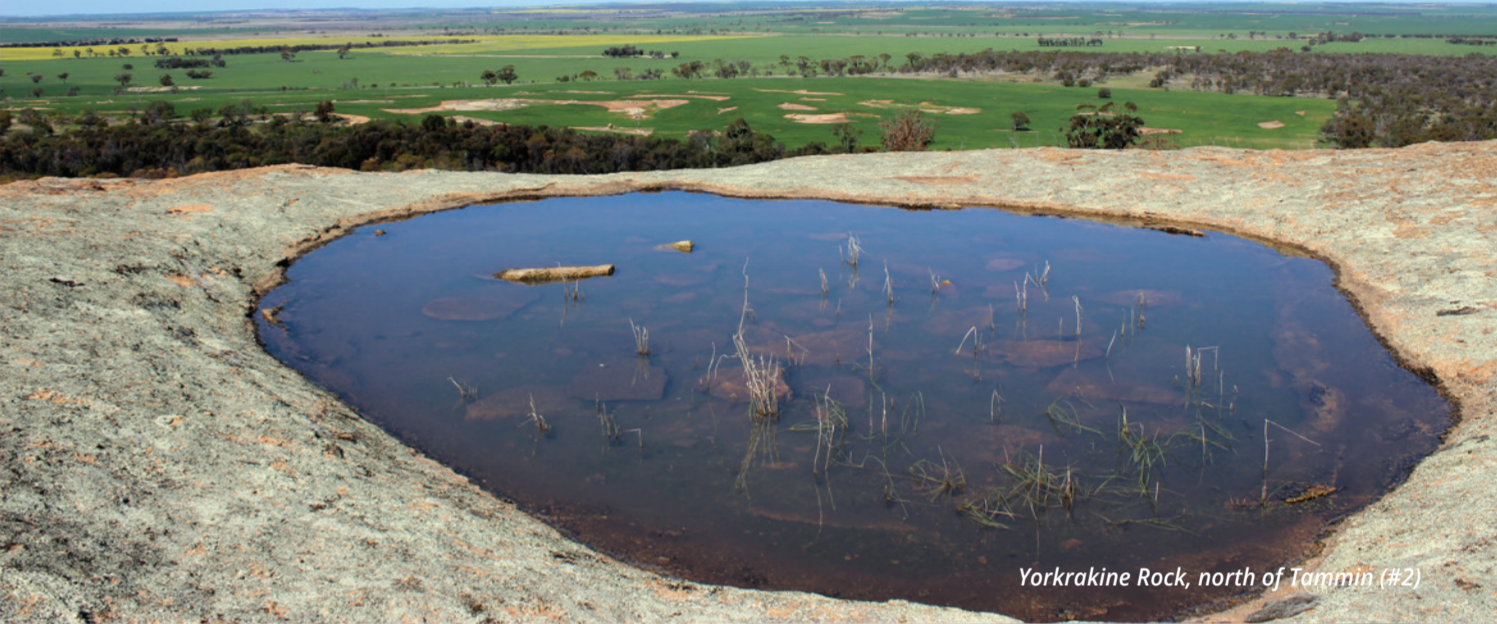
Yorkkrakine Rock, north of Tammin (#2)

E: shire@tammin.wa.gov.au W: www.tammin.wa.gov.au