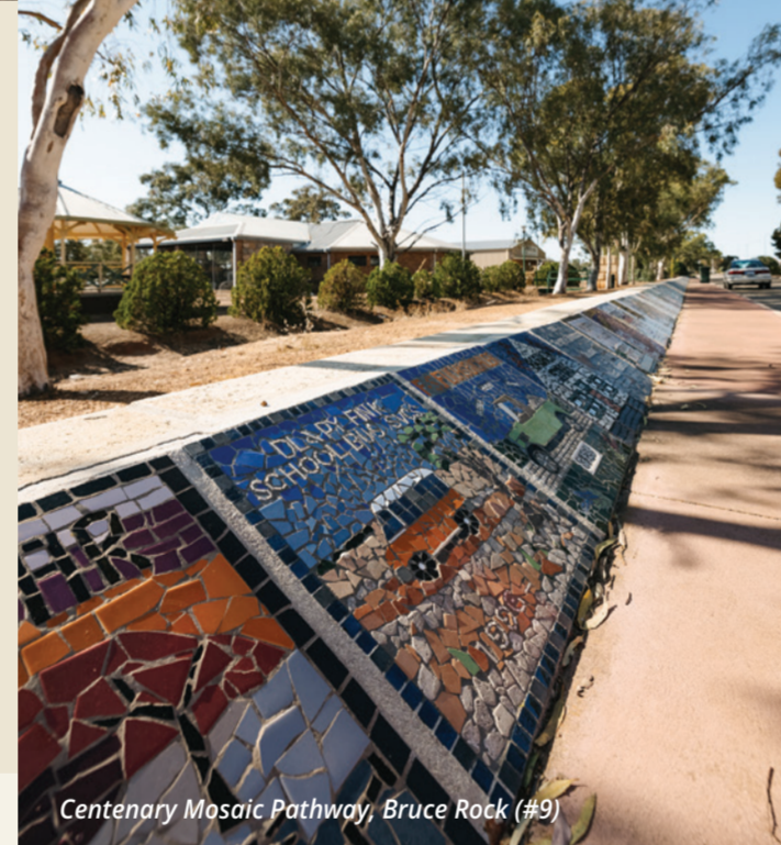
Centenary Mosaic Pathway, Bruce Rock (#9)

Then meander through the beautifully landscaped grounds of Remembrance Park, which features memorials, sculptures and artworks designed to depict the theme of war and peace.