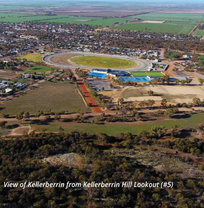
View of Kellerberrin from Kellerberrin Hill Lookout (#5)

Retrace your steps back toward town and continue on 14kms south to Charles Gardner Reserve (see #3 at map ref B6). The 600 hectares of natural vegetation contains a wide variety of wildflowers and understorey, some of which are unique to the region.